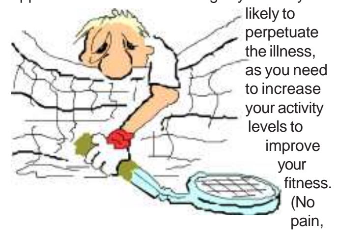
no gain). Those advocating GET also refer to consistency in order to avoid the boom-bust cycle of overexertion and relapse.

Graded activity or as it is sometimes known, graded exercise therapy (GET), is based on a theory. This theory assumes there is no ongoing disease process, but that symptoms after the acute phase are largely the result of a lack of fitness due to avoidance behaviour, plus stress, anxiety or depression. Hence it is considered safe to push yourself a little in order to reach goals. Indeed, proponents of this approach believe that listening to your body is